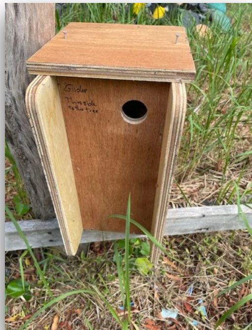
Glider nest box designed having the entrance at the back towards the tree.