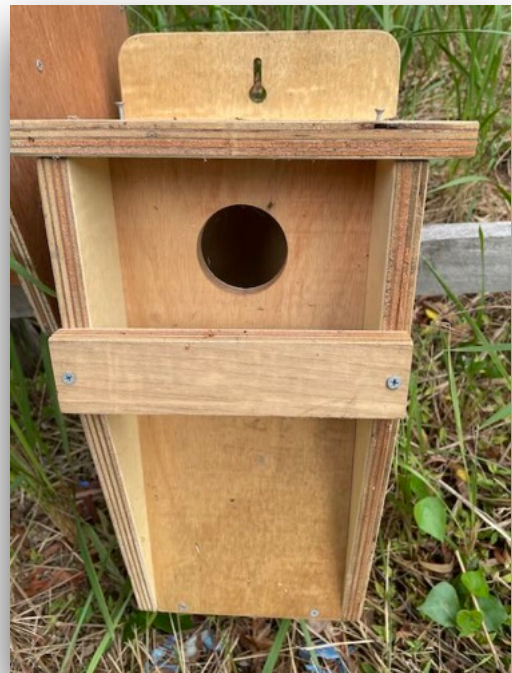
Small parrot nest box.

If you would like to purchase more of these boxes you can get them from Nest Boxes Australia - https://www.nestingboxes.com.au/ They cost around $75/box depending on the size.